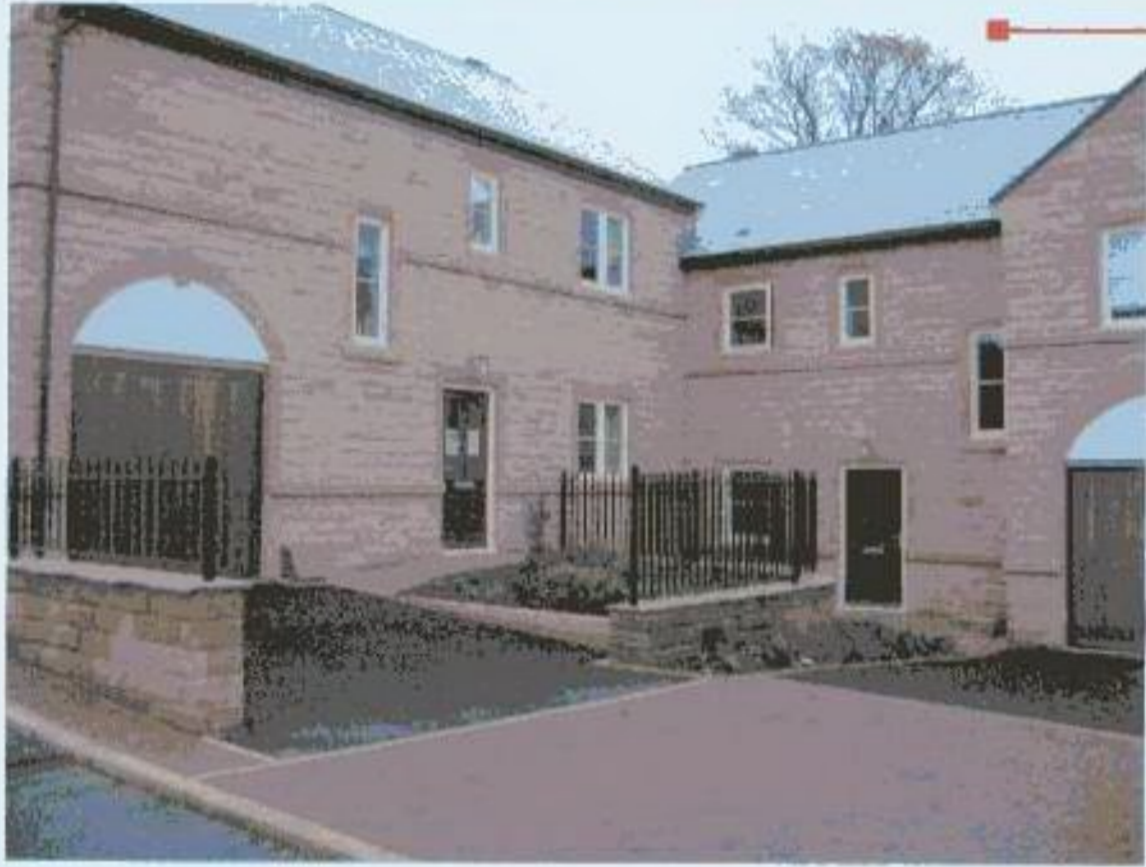
Stancliffe stone Stanton Moore Pitch Face. Ref Dwg:-115/119-210/213